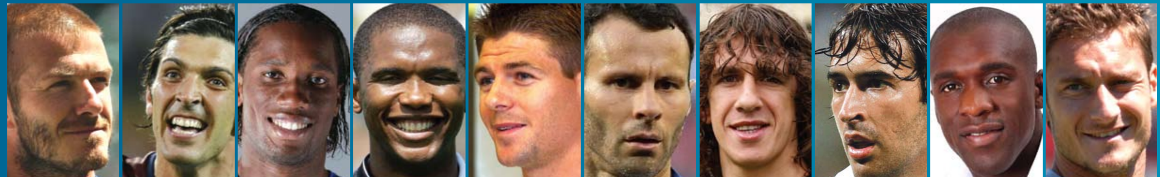
David Beckham (ENG) Gianluigi Buffon (ITA) Didier Drogba (CIV) Samuel Eto'o (CAM) Steven Gerrard (ENG) Ryan Giggs (WLS) Carles Puyol (ESP) Raul Gonzalez (ESP) Clarence Seedorf (NED) Francesco Totti (ITA)